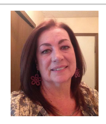
211/Crisis Hotline Certified Resource