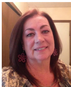
211/Crisis Hotline Certified Resource